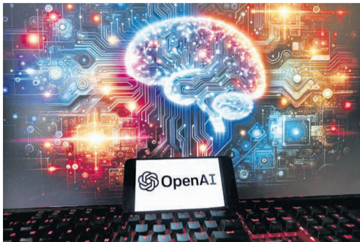
The OpenAI logo is displayed on a cell phone with an image on a computer monitor generated by ChatGPT's Dall-E text-to-image model, Friday, Dec. 8, 2023, in Boston.